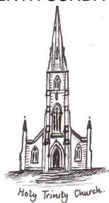
Holy Trinity Church.